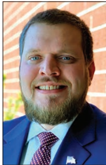
David Cooper Stanly Funeral Home