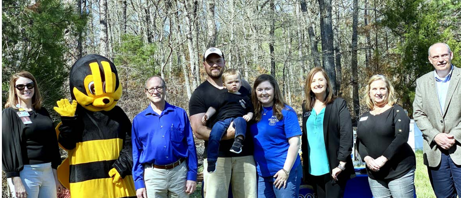
BROOKS MILL FARMS