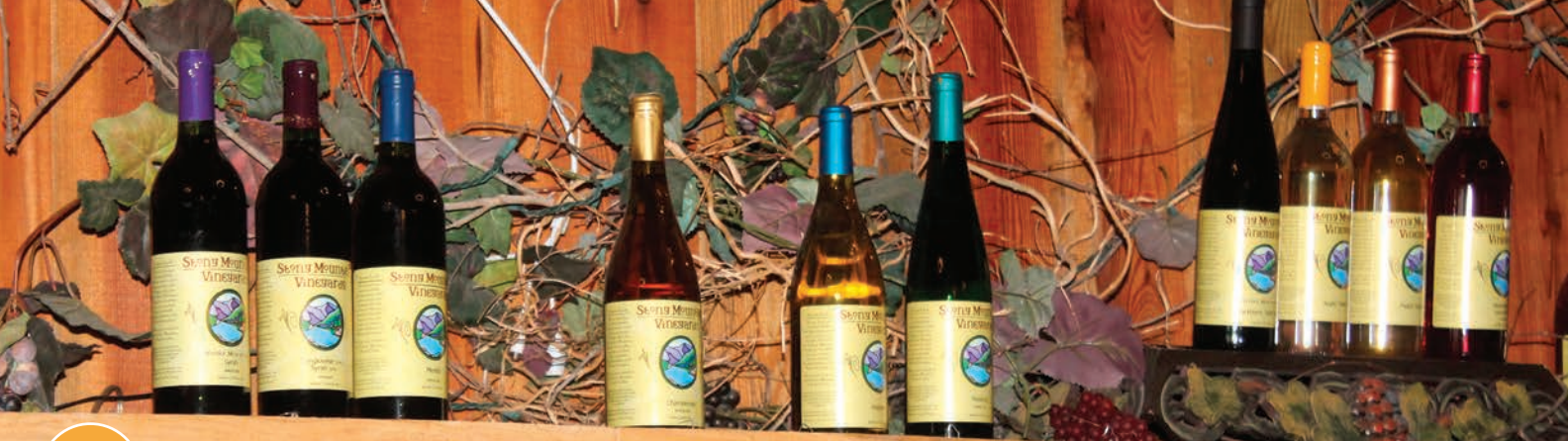
DISPLAY AT STONY MOUNTAIN VINEYARD.