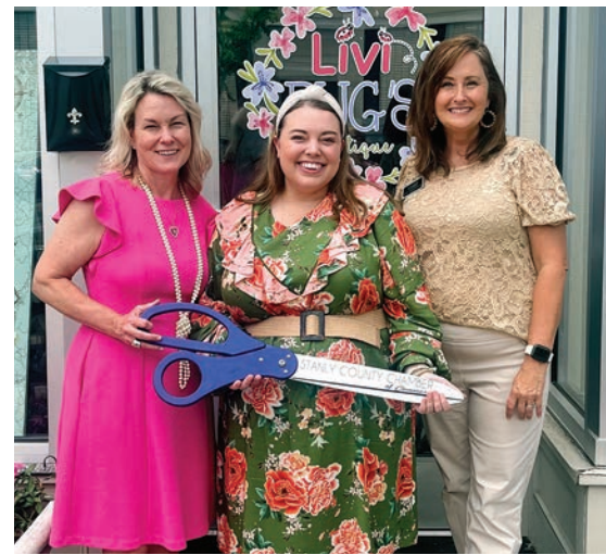
LIVI BUG'S BOUTIQUE