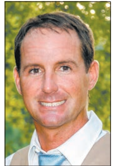
Tommy James Vision Office Systems