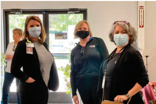
STANLY COUNTY HABITAT RESTORE

The Chamber of Commerce will provide a Ribbon Cutting Ceremony for any member business that has opened, moved or remodeled within the previous 6 months. This is a free service available to chamber members.