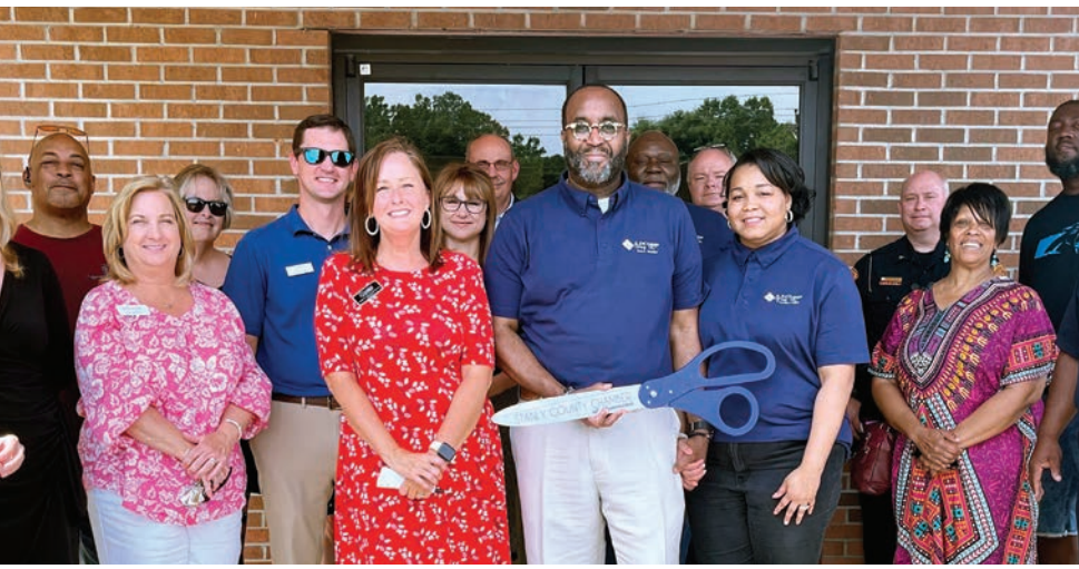
THE LIFE CHANGE GROUP NC