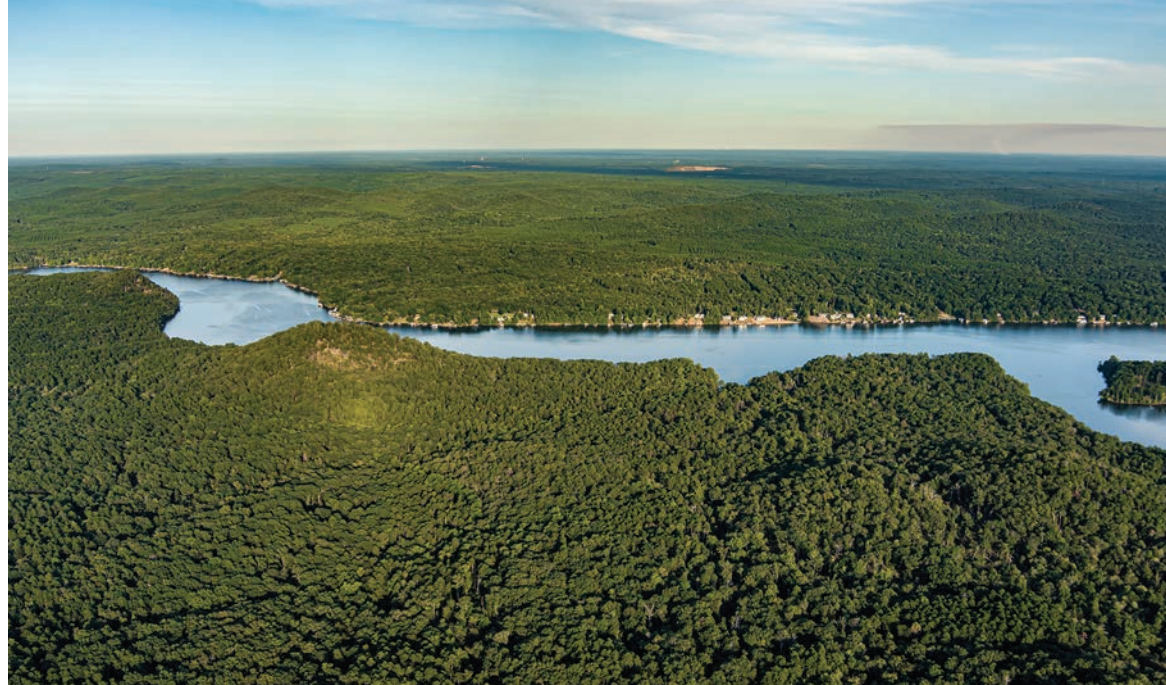
AERIAL VIEW OF ONE OF THE LAKES ON MORROW MOUNTAIN

The Stanly County Chamber of Commerce, Economic Development Commission and