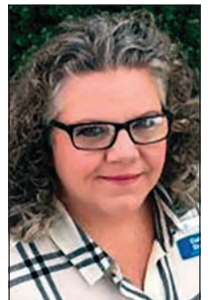
Elaine Story Trinity Place