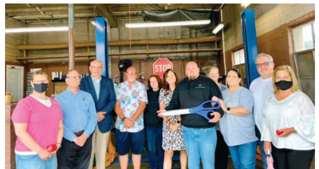
MAIN STREET INSPECTIONS